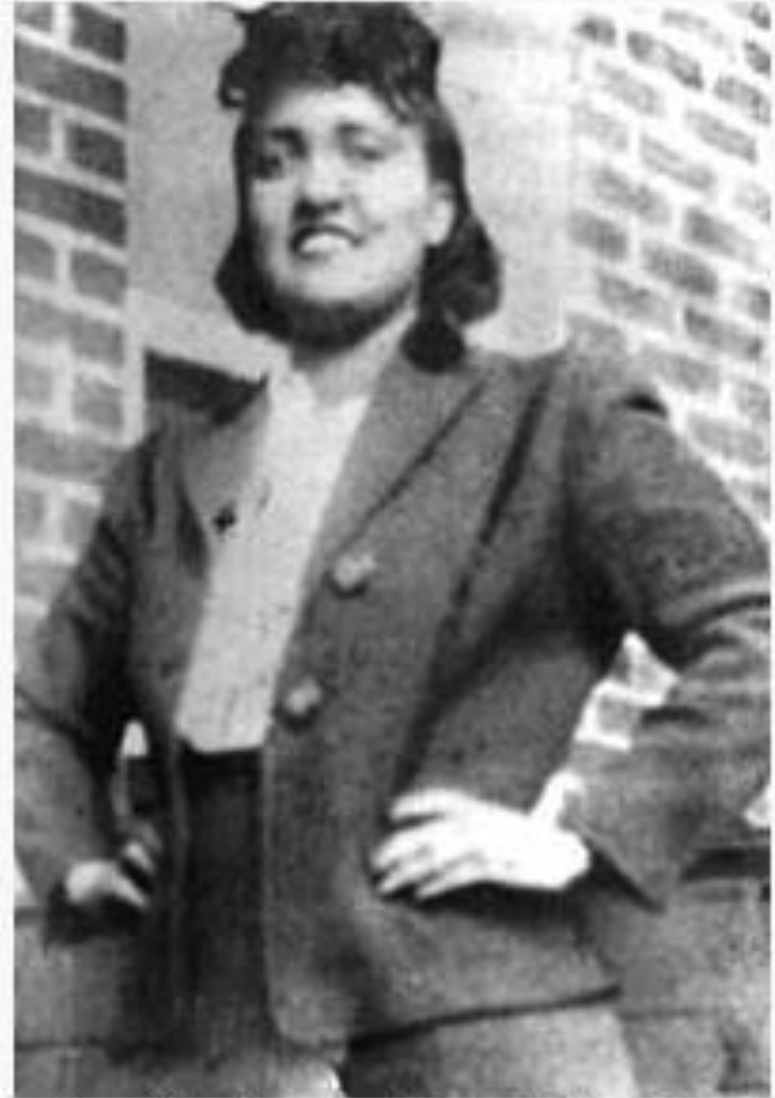
Henrietta Lacks circa 1945–1951